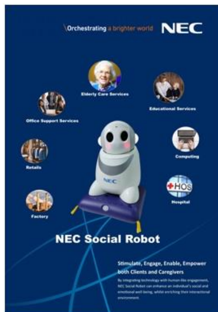
日本電氣香港有限公司 NEC 居家養老解決方案