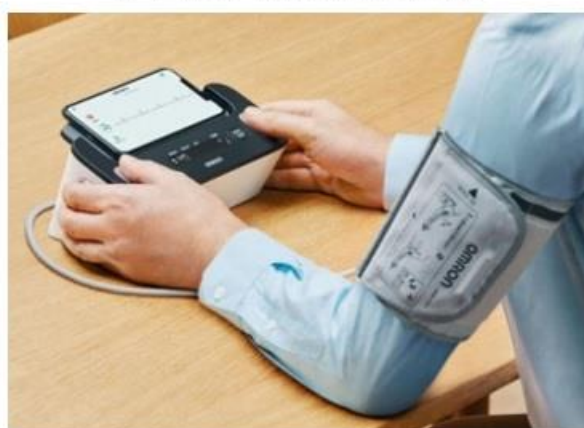
歐姆龍香港有限公司 歐姆龍上臂式藍牙心電血壓計