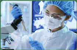
Scientific research or experiment