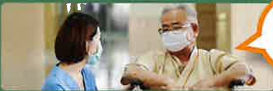
Provision of disposable plastic straws to persons with medical needs