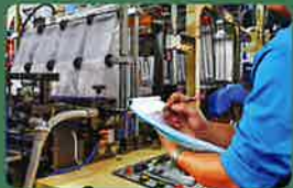
For manufacturing process