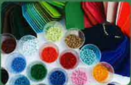
For resell purpose