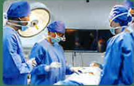
Medical treatment or procedure